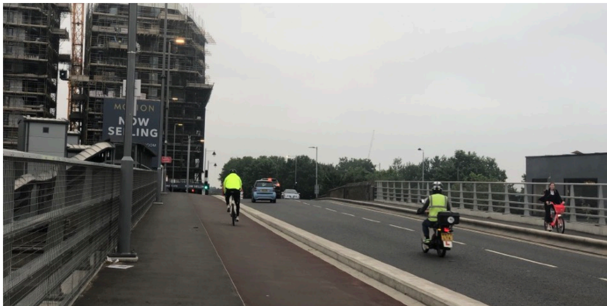
Above: Lea Bridge Road, Waltham Forest. This bridge was extended to provide space for separated cycle lanes on both sides. Both directions are well-used.

The solution was to widen the bridge with an extension, at a cost of £2.3 million. 9 The result provides a safe space for every kind of road user, and avoids conflict between walking, cycling, and driving on this important section of road near to Lea Bridge railway station. It also leads into an exemplar protected intersection , one of the first of its kind in the UK, which provides an easy and safe way for people to cycle in all directions whilst minimising pedestrian conflict.