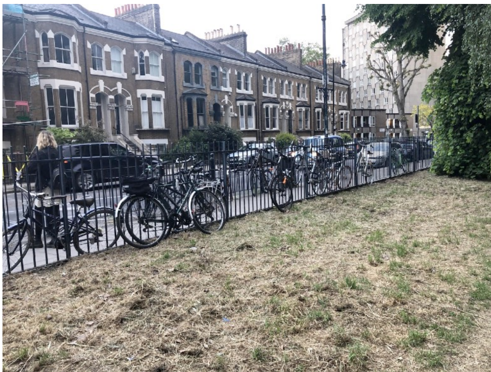
Above: Temporary overflow cycle parking for All Points East on 24th May, considerably oversubscribed.